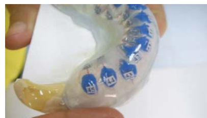
Figures 28a-b. Dip your fingers in the dishwashing liquid and then make the transfer tray as smooth as possible. Take care not to make it too thin, especially around the brackets. Use the blue retentions as a guide.