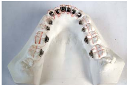
Figures 17a-b. After the full arch is finished bonding, check around the resin pads for any voids. If any defects are detected, it can be filled with 'Flowline' to give a smooth finish.