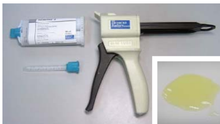
Figures 24a-c. Prepare the Memosil (Heraeus Kulzer) applicator and some dishwashing liquid to act as a separator on the fingers. Tip: to gain a longer working time, keep the Memosil in the fridge.