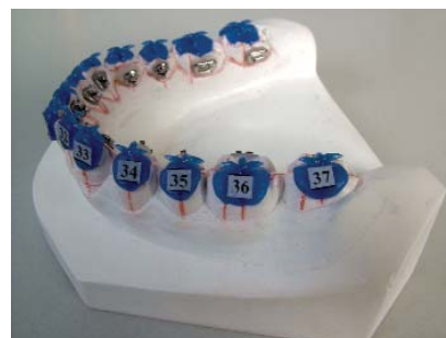
Figure 23. Finished.