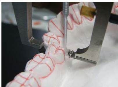
Figure 8. Clean the bracket base well with acetone to remove any grease or contamination. Place the bonding material to the bracket base using an instrument of your choice.