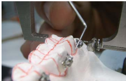
Figure 15. When bonding the molar tubes, use a special jig. Because the jig increases the distance between the caliper jaws, it is necessary to reset them to zero before placing the brackets.