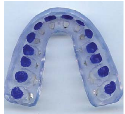
Figure 40. Replace the brackets into the tray using tweezers, steam clean gently, taking care not to move the brackets and then clean again any marks/lines with acetone and the tray is ready.