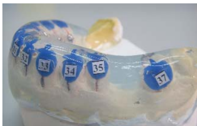
Figure 29. Finished, smoothed tray before trimming.