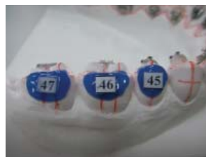
Figures 20a-d. Make a hard "Light Cure Blockout" blue key that covers most of the occlusal and vestibular surface, stopping short of the gingival margin by 1.5 to 2mm. Then stick the pre-prepared tooth number to it. Do not place it too close to the bracket or the silicone will not be thick enough.