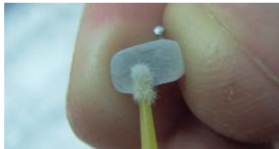
Figures 39a-b. Clean the brackets with a small brush. Dry and then clean the pad with acetone or isopropyl alcohol on a cotton micro brush.