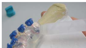
Figure 25. Apply the Memosil with steady pressure on the syringe and create an excess of material to work later. Tip: Always start at the lingual and cover the brackets entirely.