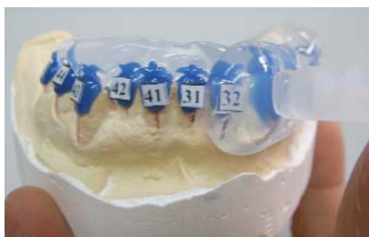
Figure 27. Move the Memosil around to the facial/buccal surfaces.