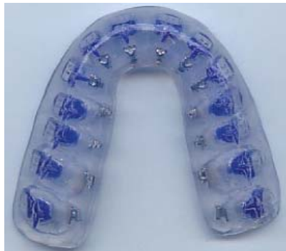
Figure 34a-b. Finished tray before sandblasting of brackets.