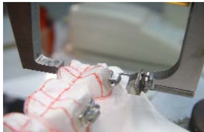
Figures 16a-b. Follow the same procedure for bonding the tubes, but be sure to have the open part of the jig towards the mesial, otherwise it will be impossible to remove it after bonding. The jig is first released from the jaws (bracket holder) and then slid out from the distal.