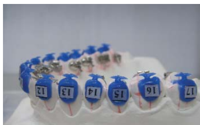
Figure 22. Make some mechanical retention on the keys and light cure again. This will be imbedded in the silicone.