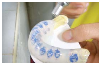
Figures 30a-b. Leave the tray for around 10-15 minutes and then rinse under cold water. Then using low pressure compressed air, break the seal at the distal edge.