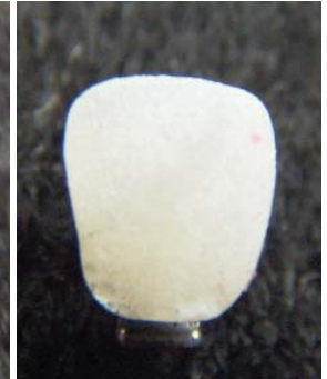
Figure 36a-c. Remove each bracket from the tray and trim the excess resin around the pad with a handpiece. Make smooth using a rubber barrel.