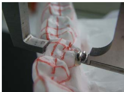
Figure 9. Bring the outer jaw into contact with the vestibular face, close the thickness calipers looking at the scale for the required thickness. Stop just short and then tap gently the last adjustment to the final reading. Never pull out and in - this will create an air space in the pad! Bonding material such as Transbond XT from 3M ESPE is good.