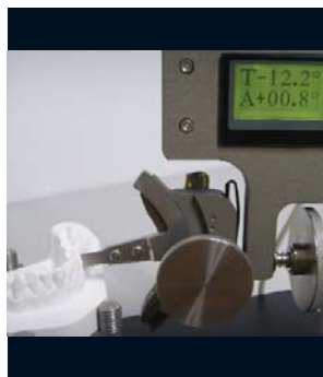
Figure 13. Check the angulation and torque for each tooth.