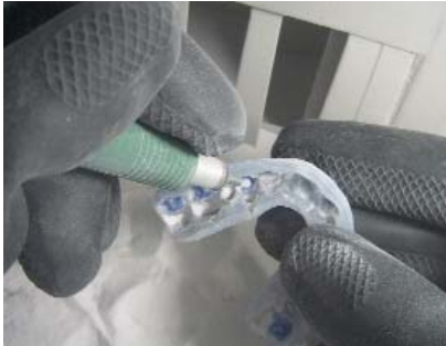
Figure 35. Sandblast the resin pads whilst still in the tray with a micro blaster using 50 micron alumina.