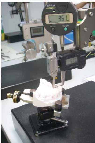
Figure 5. Transfer the model plus the survey base with its programmed torque and angulation setting to the BPD for bracket placement according to your previous height and thickness survey.