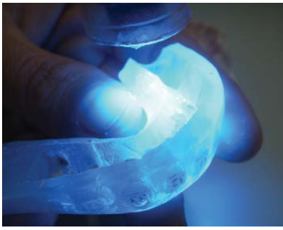
Figure 33. Light cure again from the inside to ensure the bracket pads are cured.