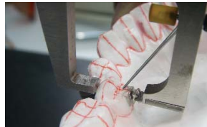
Figure 10. Clean around the bracket base with a fine probe to remove any excess bonding material. Be careful not to take out too much!