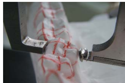
Figure 7. Place the bracket on the bracket holder with the calipers open and then place the outer jaws on the vestibular of the tooth. Descend the height by turning the fine height adjustment to the required setting. Try the bracket up to the lingual surface so you will be confident for the bonding position.