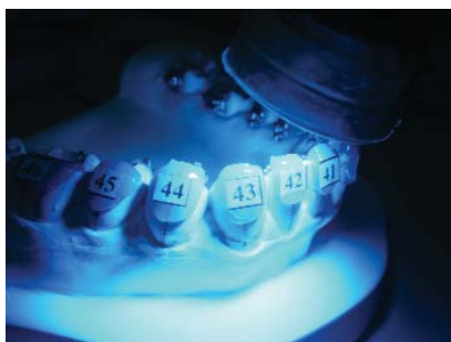
Figure 21. Then light cure it.