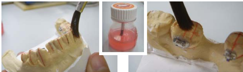
Figures 19a-c. A resin separator is now painted to the vestibular and occlusal surfaces of the model before the transfer tray can be constructed.