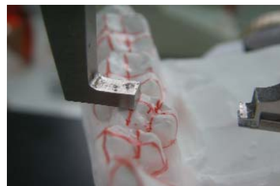
Figure 6. Using the BPD column height adjustment and the fine adjustment almost at the top of its range, bring the outer jaw of the caliper almost to the incisal or occlusal edge. Use the fine height adjustment to touch the incisal edge lightly and zero the Mitutoyo digimatic DTI.