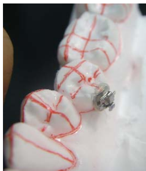
Figure 12. Check again the position of the bracket before moving on to the next one.