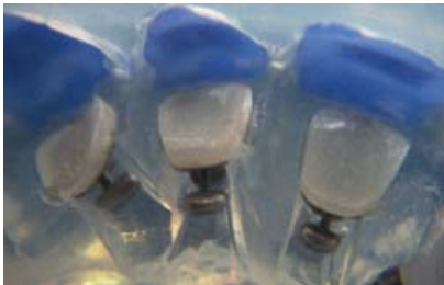
Figure 37a-b. Trim the inter-dental spaces and anything that may restrict an easy insertion in the mouth. The Memosil should be removed from the underside of large brackets or brackets with hooks so that removal of the tray will be easier and not stress any bonding. This way the tray will also not be damaged and can be re-used for any re-bonding.