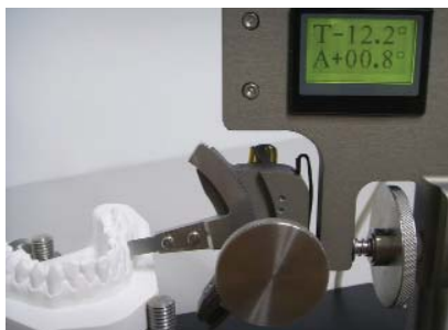
Figures 4a-b. Starting with the anteriors, use the TAD to set the torque and angulation. Adjust the survey base to match the facial/buccal surface of the tooth to the blade of the TAD by using the tilt of the base in conjunction with the fine height adjustment of the TAD (if you are using the LA point, match this to the scribe line in the centre of the TAD blade).