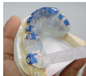
Figure 26. Next, cover the occlusal surface and the retentions.