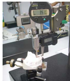
Figure 14. Check the height and thickness for each tooth.